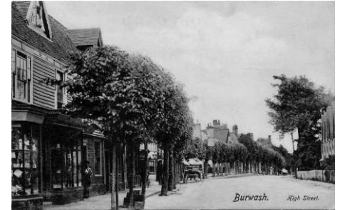
Burwash High Street, 1907